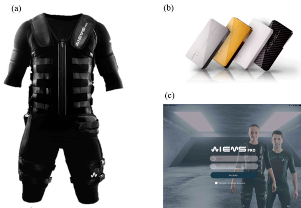
Figure 2. (a) Whole-body electromyostimulation suit; (b) whole-body electromyostimulation devices that transmit electrical stimuli; (c) whole-body electromyostimulation app to configure electrical stimuli.

The WB-EMS protocol was performed using an electromyostimulation device (Wiemspro ® , Malaga, Spain), which simultaneously stimulates 8 muscle groups (i.e., upper legs, upper arms, upper back, gluteal, abdomen, chest, lower back, and shoulders; total size of electrodes: 2800 cm 2 ) (Figure 2).